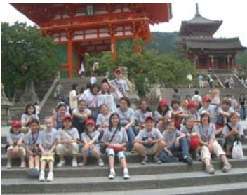
2005 5th Grade Cultural Trip to Kiyomizu, Kyoto

Oya No Kai provides funds for vital cultural support such as: native Japanese speaking teachers' aides in grades K-12; sponsorship of cultural exchange trips for 5th and 8th grade classes; curriculum enhancement; calligraphy